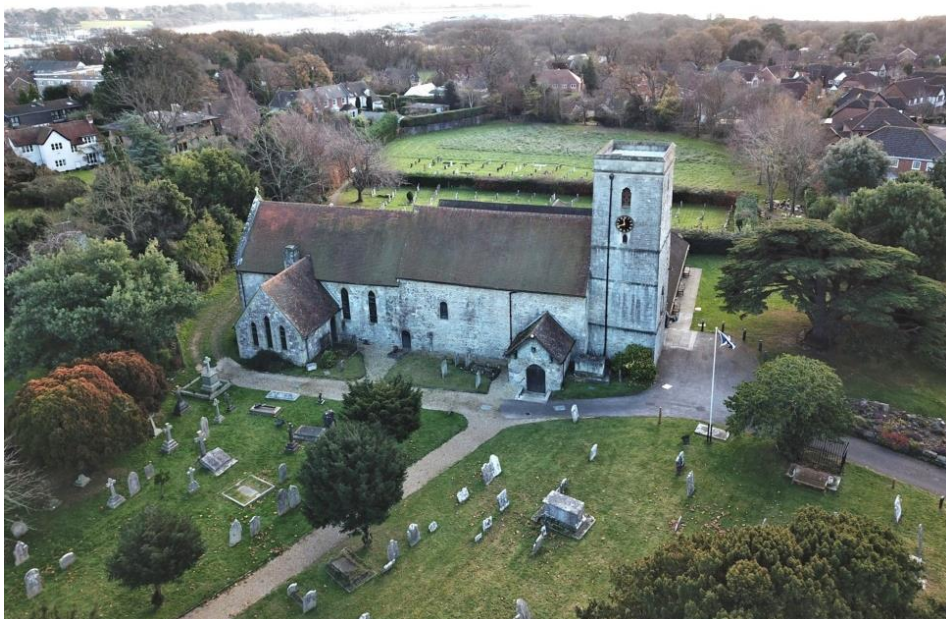
St Andrews Church, Hamble le Rice

Unless special arrangements have been made with RSYC's Bosun, skippers with boats are asked to settle their berthing fees and vacate the pontoons by the evening.