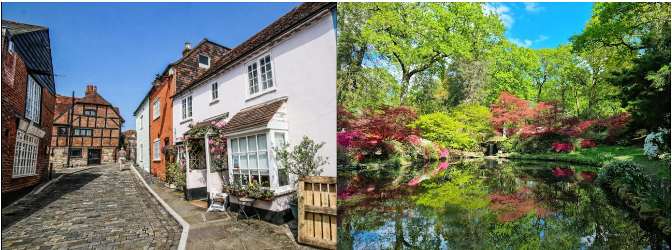
Hamble le Rice Village

For those with vessels there is the club's marina in front of the club with berths available for visitors.