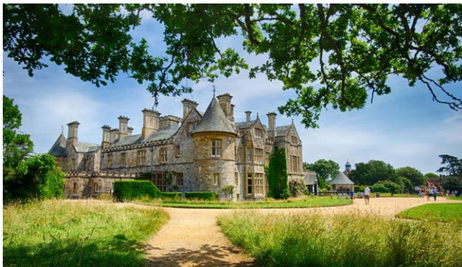
Beaulieu Palace House