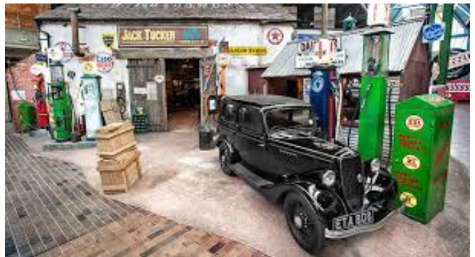
Beaulieu Motor Museum